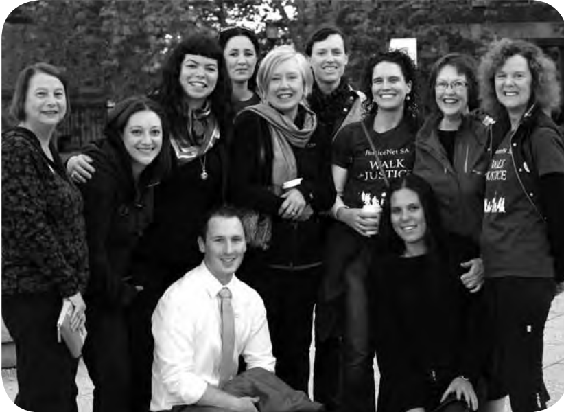
2014 Walk for Justice team

office with simultaneous webcasts across South Australia. Registration for a public information session is now available online through the Commission's website.