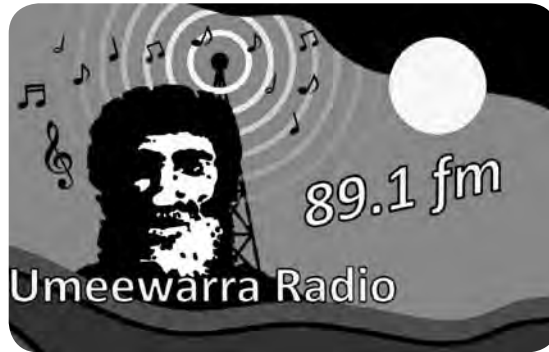
Far north community radio station – Umeewarra