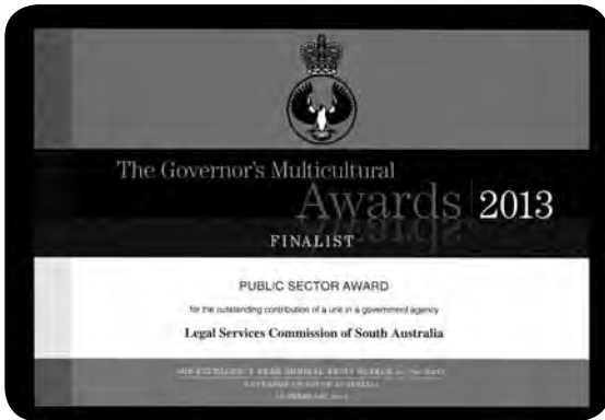
Governor's Multicultural Award 2013 for work in migrant education